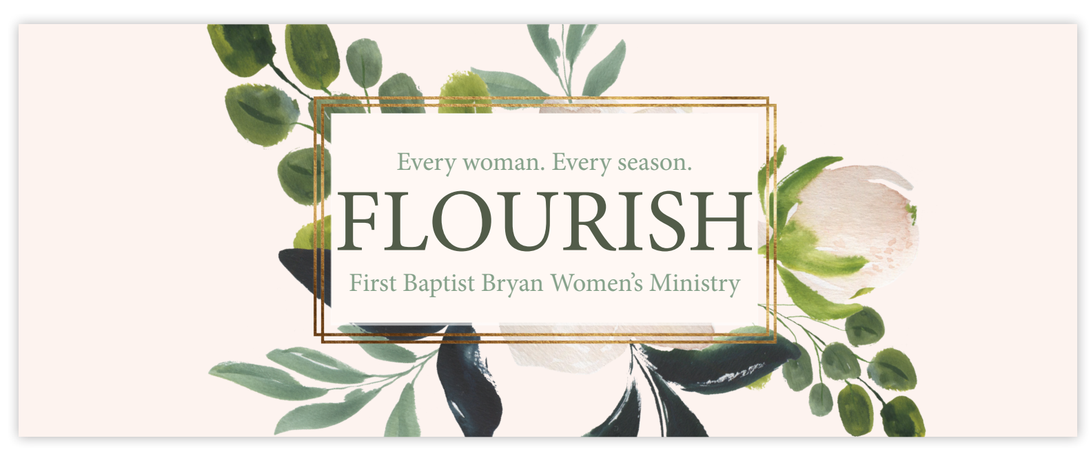
flour-ish | verb

to grow or develop in a healthy or vigorous way, especially as the result of a particularly favorable environment